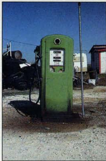
GREEN LANDING UNNOTICED